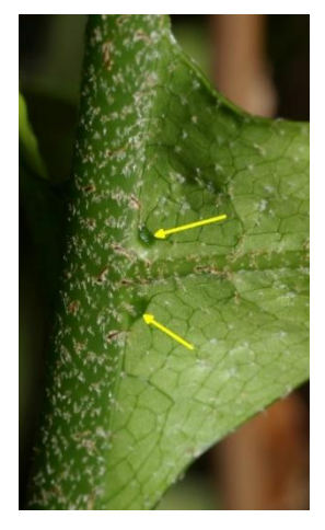
Drynaria c dumicola nectaries

The Australian species D. rigidula and D. sparsisora both possess nectaries, as does their hybrid, D. × dumicola . In the latter two, with their pinnatifid i.e. lobed fronds (rather than 'stalked' separate pinnae), nectaries are apparent as yellowish translucent 'dots' in the frond, usually, but not always, located in the axils where each pinna lobe joins the rachis of the frond. Axillary nectaries in D. sparsisora seem to be confined to the upper axil, but as with the photo here, those of D. × dumicola may be in the upper, lower or neither 'leaf' axils, probably as a result of inheritance from both parents.