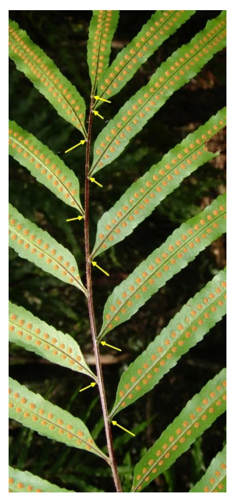
Drynaria rigidula nectaries arrowed

Nectar secretion is not usually associated with ferns, but 11 or so genera have some species which possess nectaries. The majority of these are in the families Cyatheaceae and Polypodiaceae. I'm going to concentrate on Drynaria (Polypodiaceae) in this note, as the nectaries probably help to protect developing fronds from insect predation, due their ability to attract ants, as well as being useful to us by helping to confirm identification.