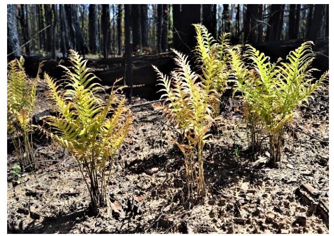
Gristle Fern Blechnum cartilagineum

Ferns are generally thought of as delicate plants susceptible to desiccation and destruction by bushfire. However, those species that grow on the highly fire-prone sandstone country of the Sydney Basin and elsewhere have evolved mechanisms that allow them to resprout after a bushfire, even the most severe bushfire. The extensive and intensive bushfires of 2019-20 have provided the opportunity to observe these ferns and how they return after a fire. While some species have rhizomes/roots that allow them to survive fire and readily resprout after the fire, others have thick trunks that protect the growing shoots within. Some examples of fern species emerging after the 2019-20 fire on the NSW south coast are shown below; all photographs were taken within a few months of the fire.