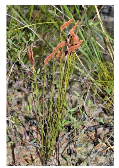
Forked Comb Fern Schizaea bifida