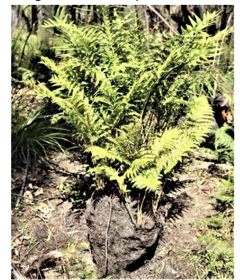
King Fern Todea barbara