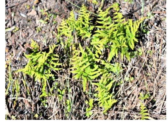
Pouched Coral Fern Gleichenia dicarpa