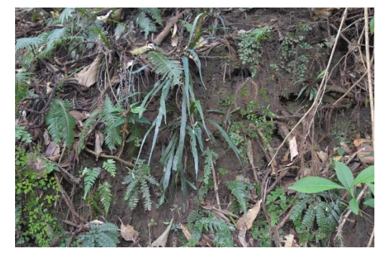
Fern bank on Little Yabba Creek Circuit

all the Little Yabba Creek Circuit and about 200 metres of the Piccabeen Circuit. The total distance for both circuits is 3.5 km with riparian rainforest (R.E. 12.3.1) near Little Yabba Creek. Dry rainforest (R.E. 12.11.1) on metamorphics is found on the slopes of the Piccabeen Circuit, with Archontophoenix cunninghamii in the moister protected gullies (R.E. 12.11.1). The section of palm forest on the Piccabeen Circuit is moist and protected with a well-developed subtropical rainforest along the gully lines about half way around the circuit.