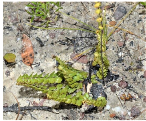
Screw Fern Lindsaea linearis