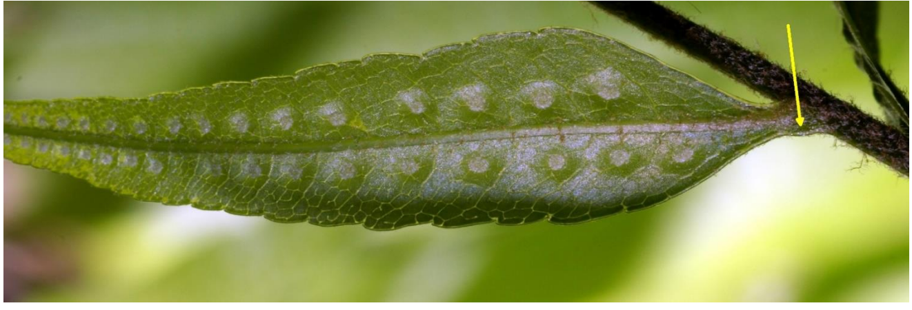
Closeup of D. rigidula pinna showing nectary