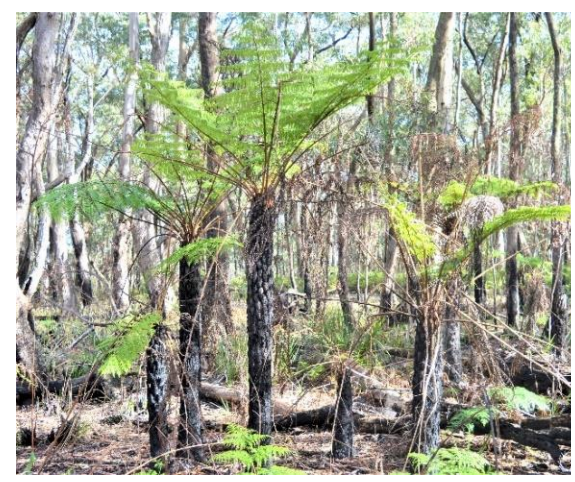
Rough Tree Fern Cyathea australis