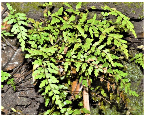
Oval Wedge Fern Lindsaea trichomanoides at Mount Wilson