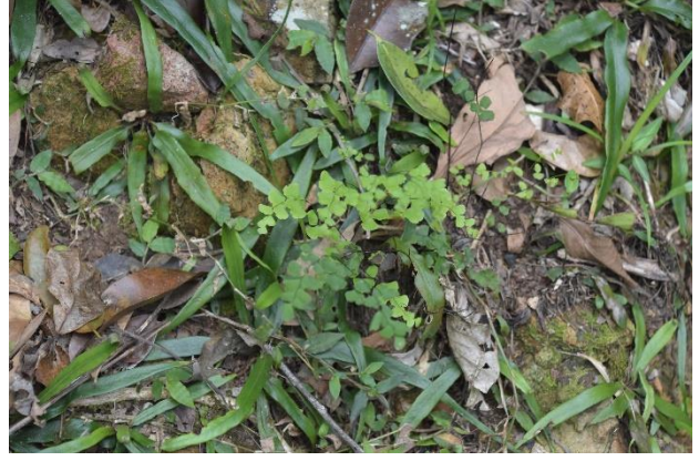
Adiantum atroviride among Asplenium attenuatum

The remaining members started the walk which goes parallel to and a short distance from Booloumba Creek, crossing 2 small ridges on a well-made graded track before crossing the creek, joining the Great Walk, and heading further upstream before going up a side gully to the old mine. As usual in this type of environment, quite slow progress was made because of the many ferns present, and we ran out of time before crossing the creek, with a couple of members exploring briefly beyond it. We recorded 26 species of ferns in the moist forest. One notable feature was Asplenium attenuatum covering considerable areas above the track.